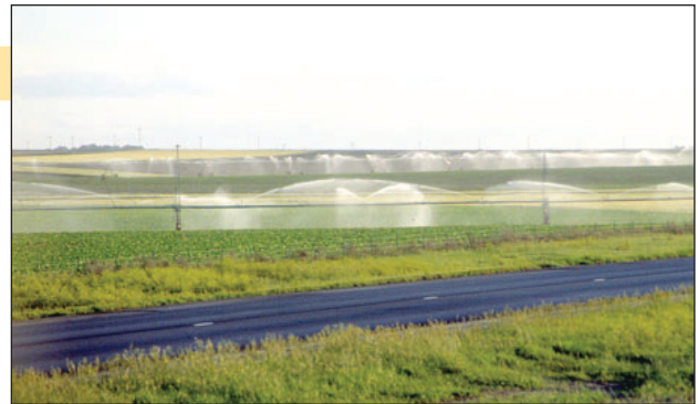
Irrigation (courtesy J. Charlton, Kansas Geological Survey).

Programs designed to address these issues must recognize that although national interest in water issues is considerable, states maintain dominant roles in setting water policy.