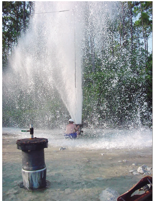
Groundwater well.